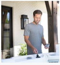
FreshWater® Salt System Ready